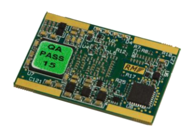
Fig 1.a: TC2 Top view